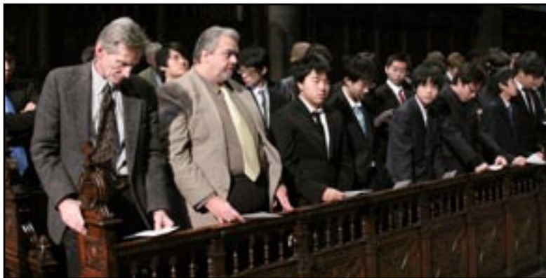
Students and faculty seen here during an all school trip to Albany, NY. School trips are one of the considerations covered during the planning of the annual Hoosac budget.

Parents and teachers are concerned about the school budget next year. Many school budgets across the country are going down next year. They are cutting teachers and courses and even extra curricular activities. Many