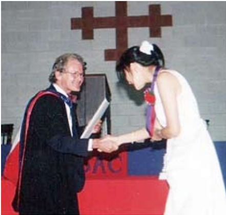
Board Chairman presenting diploma at Prize Day.